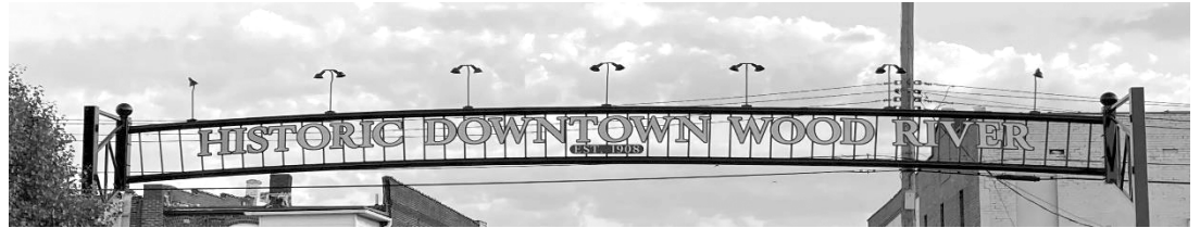
Downtown "Welcome Sign" made possible with grant funds.

Happy 40 th Anniversary to the Pipeline! The first edition was published in November 1981. The mission statement printed in that very first issue was: